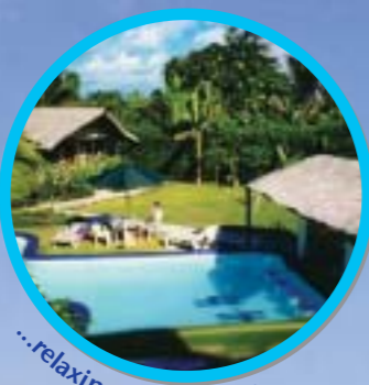
...relaxing by the pool