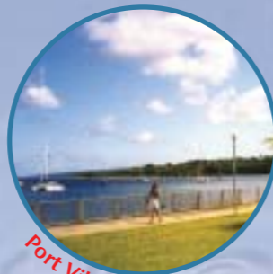
Port Vila harbour

Located on Efate (see map on back cover), one of more than 80 islands that make up Vanuatu, Worawia Holiday Haven offers accommodation in self-contained 'fares' (bungalows) built and decorated in traditional style.