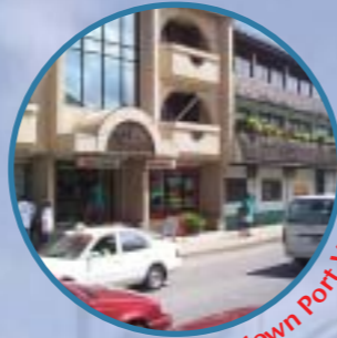
Downtown Port Vila