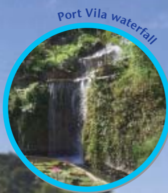
Port Vila waterfall