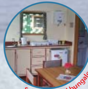
Self contained bungalows