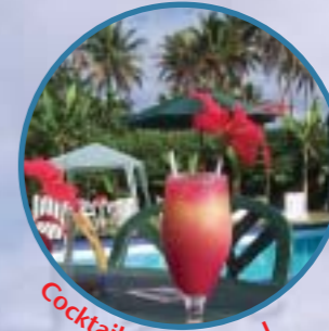
Cocktails by the pool

If you prefer to eat privately, you can order via the bar or reception for delivery to your bungalow. Eating out is also an easy alternative with restaurants in Port Vila only 10 minutes drive away.