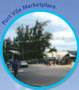
Port Vila Marketplace