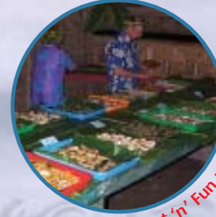
Feast 'n' Fun night

Looking for a place where relaxation, recreation and rejuvenation are a part of daily life?