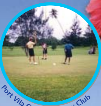
Port Vila Golf & Country Club